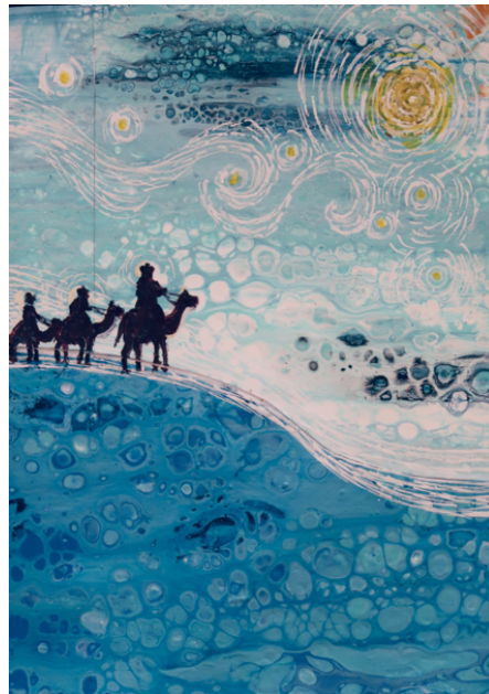
"Follow the Star" by Rachel Vitolo