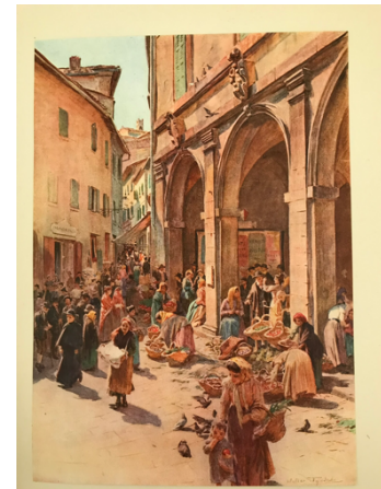
Market in Montepulciano