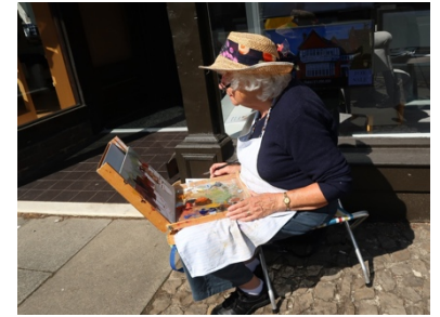
Painting in Town